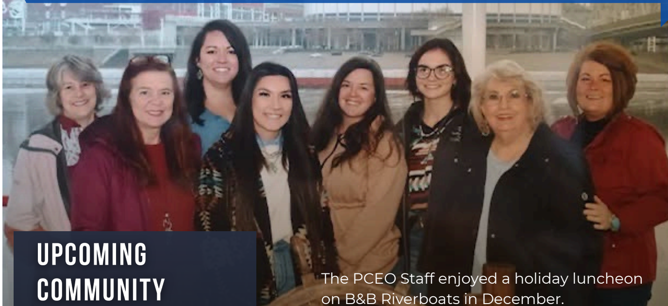
The PCEO Staff enjoyed a holiday luncheon on B&B Riverboats in December.