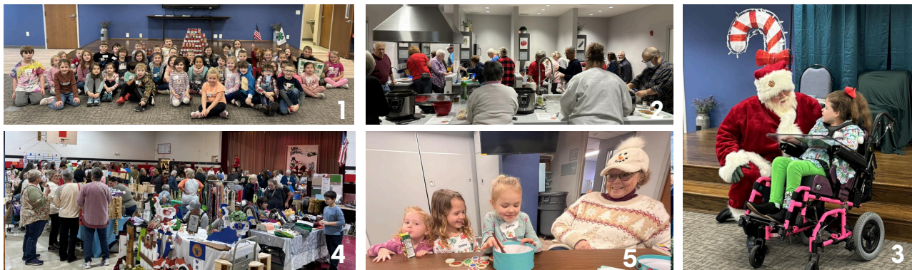
Photos: 1 - Cloverbuds food drive 2 - Commodity Cooking and Food and Kitchen Safety 3 - Christmas Storywalk 4 - Winter Wonderland 5 - Flowerbuds Soup day