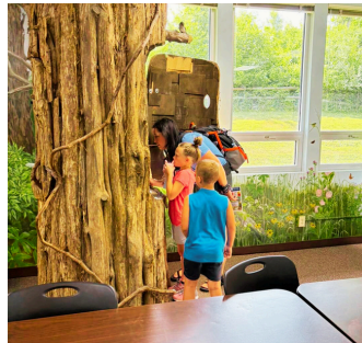
Top (clockwise): Tractor Driving Champions at the Pendleton County Fair, these kiddos will go to State Fair in August; The NKY KACAA Area Planning Committee at Annual Meeting Picnic; Checking in on the observation beehive with our Fitness for Produce Hikers; The Kentucky Delegation representing in Dallas at the National Association of County Agriculture Agents Annual Meeting.