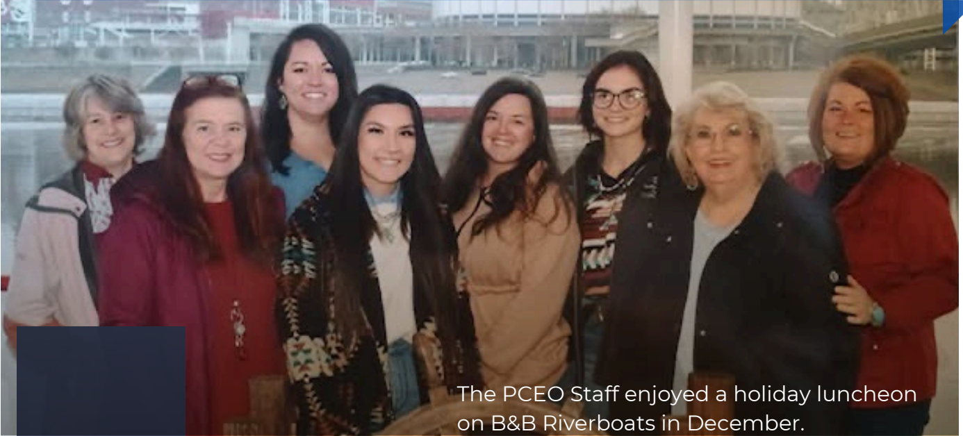
The PCEO Staff enjoyed a holiday luncheon on B&B Riverboats in December.