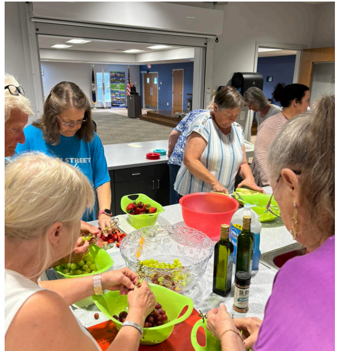
Top (clockwise): PENco Hikers took on the Pinnacles at the Berea College Forestry Outreach Center, Participants working together in the kitchen for Food as Health, Little Drummer kiddos learning patterns and rhythms at Pres-school Camp, and families gathering at the Fairgrounds for Storwalk.