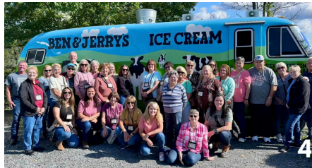
Photos: 1 - Flowerbuds 2 - Mammoth Cave Hike 3 - Homemaker Annual Meeting 4 - Ben and Jerry's on Agricultural & Cultural and Heritage Tour 5 - StoryWalk