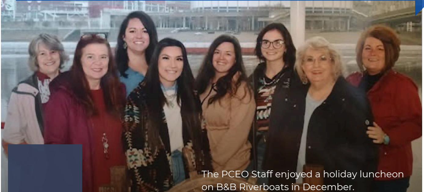
The PCEO Staff enjoyed a holiday luncheon on B&B Riverboats in December.