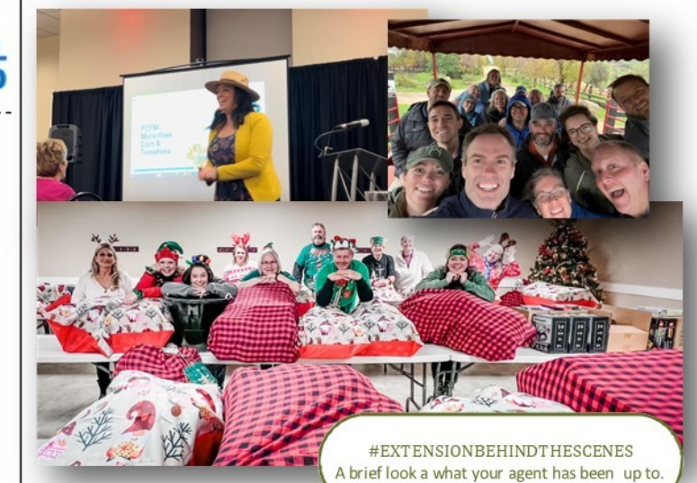
#EXTENSIONBEHINDTHESCENES A brief look at what your agent has been up to.

From Top: 1) #lindiecountyagent presenting at the Farmers' Market Short course at the 2023 KY Fruit & Veg conference. 2) KALP Class XII on a farm wagon ride in Spain at a bull breeding operation for the cultural event of bull fighting 3) Santa's elves deliver the collected Christmas gifts to the 24 flood survivor families in Knott County.